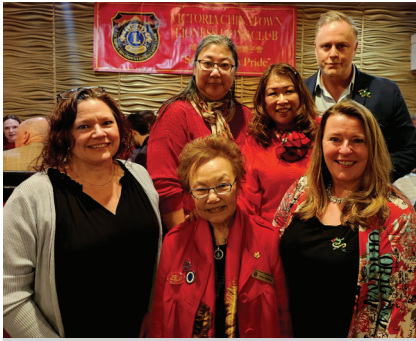
Top—Vancouver East Lions Club 80th Anniversary Gala