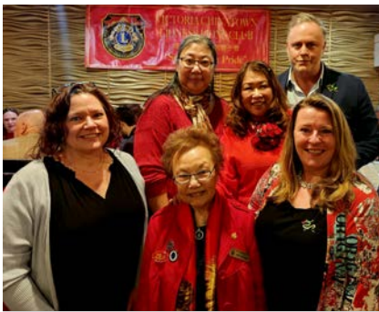
Top—Vancouver East Lions Club 80th Anniversary Gala