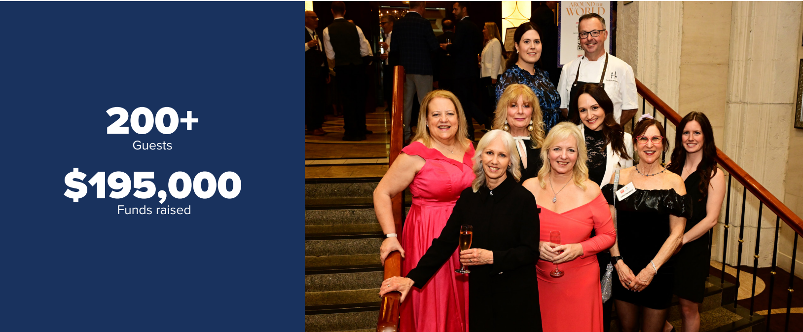
The Around the World Event Committee